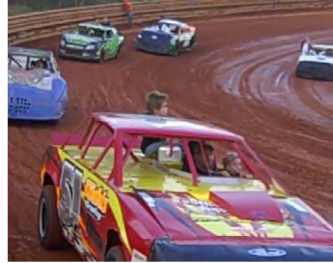
Rolling in the track weekly has become an event on it's own for families, drivers and fans alike.