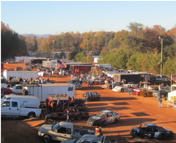
The pit view is something to see each and every Saturday night at TR. Working together makes each week spectacular.