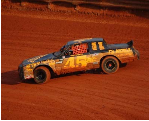
#45 Buddy Whitworth before his big crash which took him out of racing for many months in 2010.